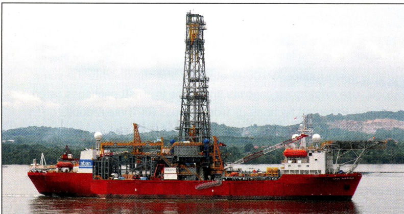
The Aban Abraham underwent major upgrades and has now completed seatrials. It is heading to offshore Africa to drill on the Cape Three Points deepwater block.